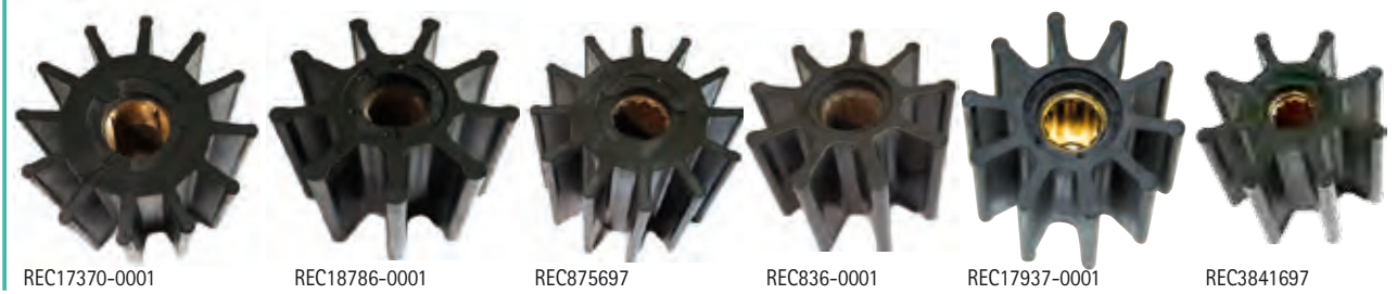
REC17370-0001 REC18786-0001 REC875697 REC836-0001 REC17937-0001 REC3841697